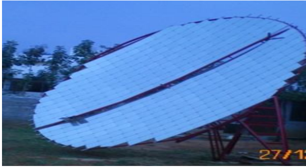
Fig. 1. (a) A model of SRWH system, (b) Schematic of SRWH